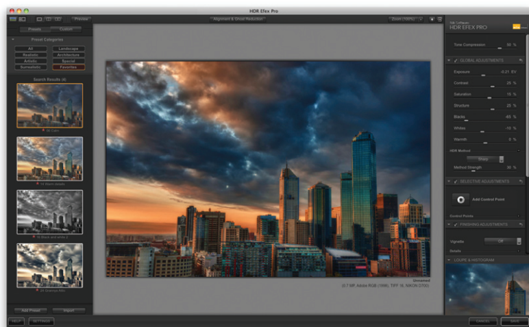
HDR Efex Pro* interface

Using Intel® Composer XE, Nik Software had access to AVX support before the corresponding hardware was available on the market. This meant that early in their development process they could efficiently prototype and develop implementations with intrinsics. The software, optimized for Windows* and Mac*, and Intel or AMD* processors that support AVX, was developed in C/C++.